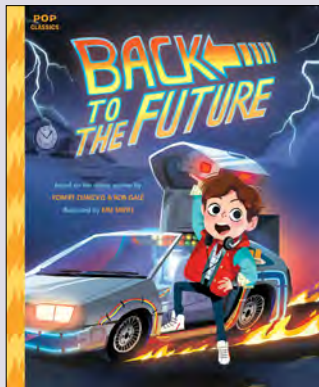
Back to the Future ISBN 978-1-68369-023-8

™ & © 2018 by Twentieth Century Fox Film Corporation. All rights reserved.