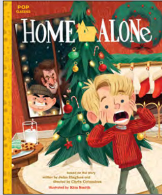
Home Alone ISBN 978-1-59474-858-5

Parents can share their pop culture favorites with the next generation with lively and colorful picture books that reimagine iconic moments and characters from TV and movie classics. Kids will love the timeless stories, and parents will love a little nostalgia at bedtime.