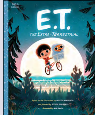
E.T. the Extra-Terrestrial ISBN 978-1-68369-010-8

™ & © 2020 by Twentieth Century Fox Film Corporation. All rights reserved.