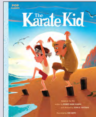
The Karate Kid ISBN 978-1-68369-092-4

™ & © 2018 Twentieth Century Fox Film Corporation. All rights reserved.