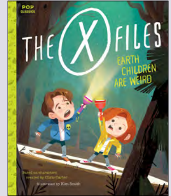
The X-Files: Earth Children Are Weird ISBN 978-1-59474-979-7

© 2018 Universal Studios. E.T. the Extra-Terrestrial is a trademark and copyright of Universal Studios. All rights reserved.