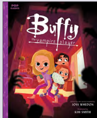
Buffy the Vampire Slayer ISBN 978-1-68369-069-6

© 2018 Universal Studios. Back to the Future is a trademark and copyright of Universal Studios and U-Drive Joint Venture. All Rights Reserved.