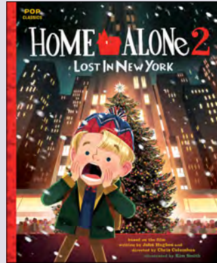
Home Alone2: Lost in New York ISBN 978-1-68369-136-5

™ & © 2020 by Twentieth Century Fox Film Corporation. All rights reserved.